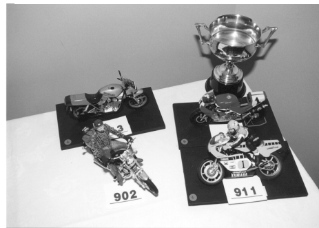
Class 6 Best Motorcycle entries