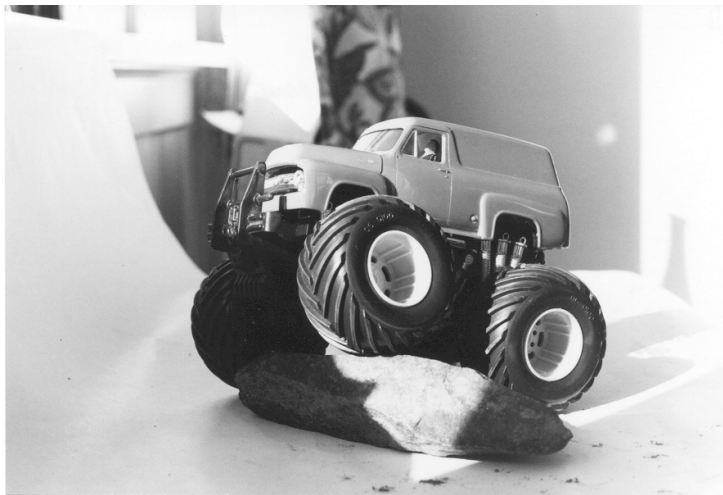
One of Maurice's 'Bigfoot' creations utilising a Monogram '55 Ford Panel Delivery van