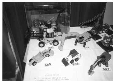
The entries in Titan Plant Services Construction Vehicle Services