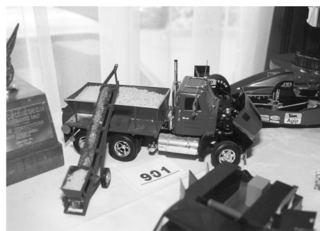
Class 4 winning Volvo