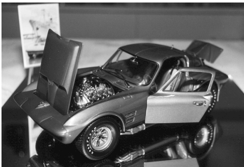
Exoto Corvette Grand Sport 1st Class 27