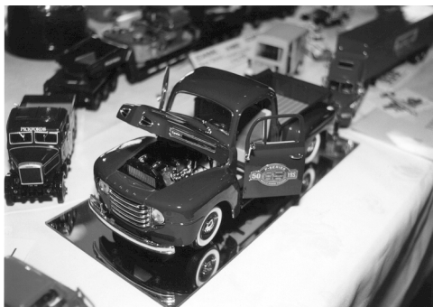
Ford F100 2nd Class 18