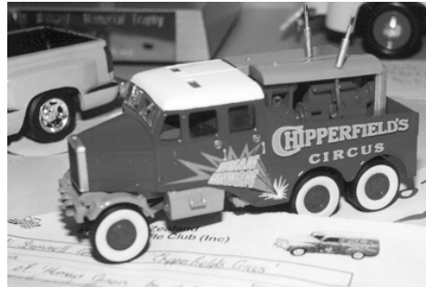
Winner of The Clyde Wright Memorial Trophy