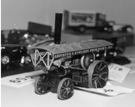
Fowlers Showman 1st Class 28