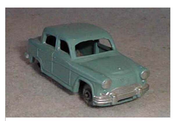
Matchbox No 36 Austin A50