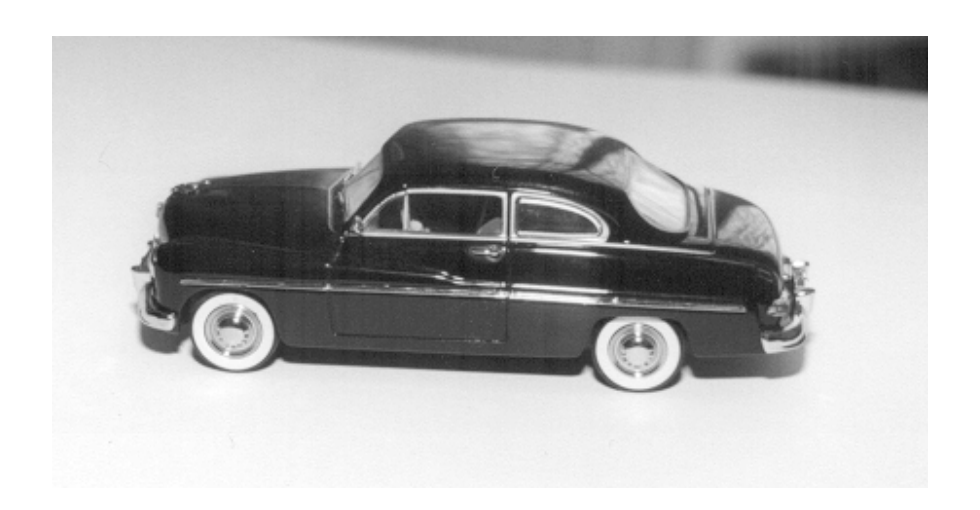
ABOVE & RIGHT 1949 Mercury Club Coupe by Eagles Collectibles