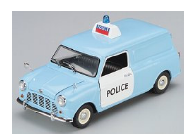
KYOSHO KYOV0303 Minivan UK Police