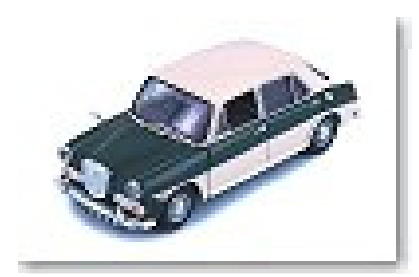
Vitesse VCC 060 Wolsley 1100 Green and Biege

EXOTO GP Classics 1/18 Diecast USA 1979 Ferrari 312T4 South Africa GP Sheckter or G. Villeneuve (1<sup>st</sup>)