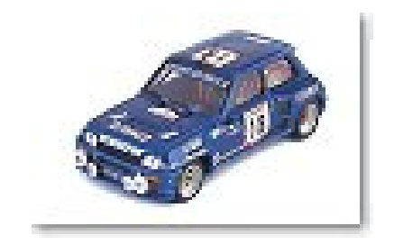
SKID SKC 009 Renault 5 Turbo TdC 80 Complete with Tobacco markings!