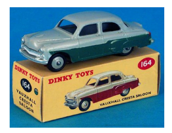
Dinky E Series Cresta