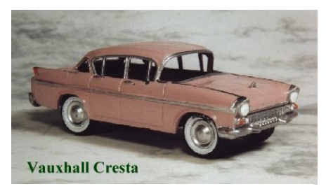
Micro Models PA Cresta