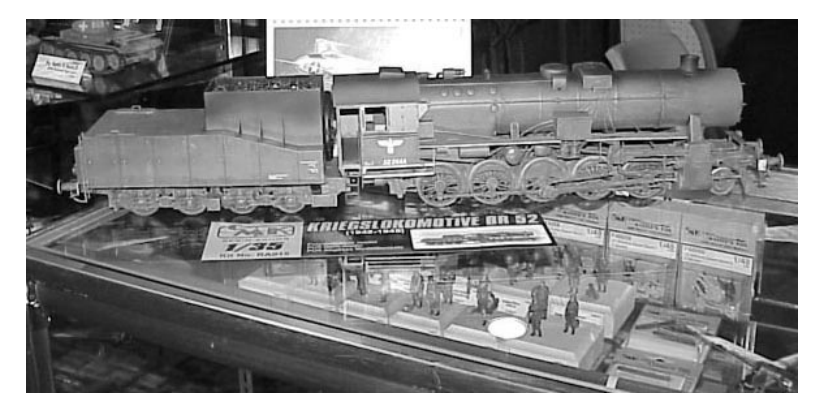
Not Your Average Railway Model (See IMHE Report)

Miniature Auto is the bi-monthly newsletter of The New Zealand Model Vehicle Club (Inc)