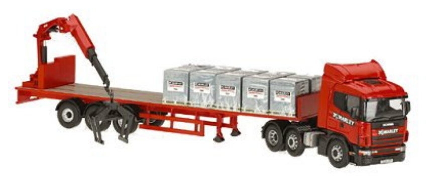
Corgi CC12217 Scania 4 Series Flatbed Crane Trailer with Palletised Load. Marley Building Materials