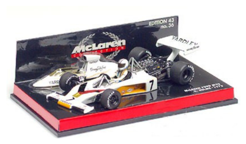
Minichamps 1:43 McLaren M23 Denis Hulme with engine detail. Now Available

A publication for and by collectors and builders of model vehicles