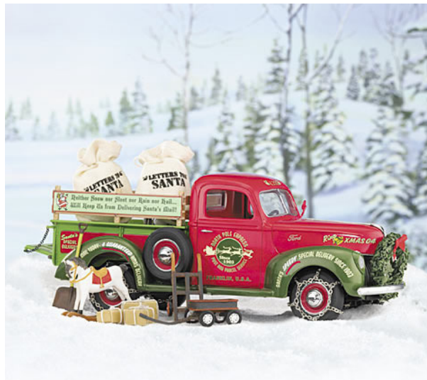
Franklin Mint 1:24 1940 Ford Pick Up Christmas 2004