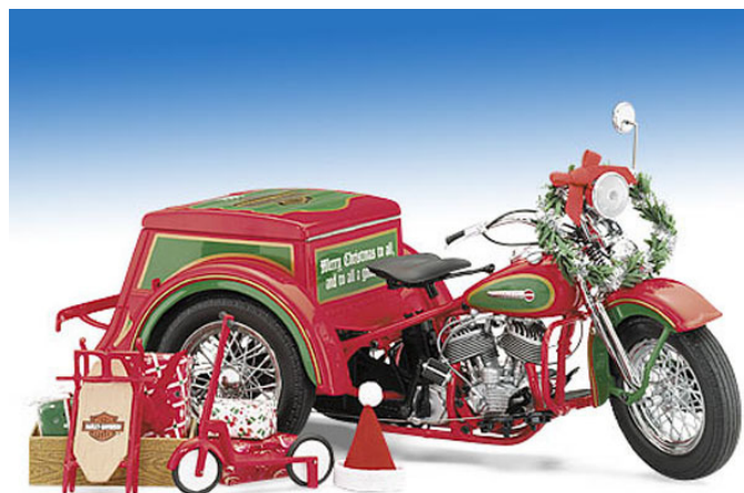
Franklin Mint 2004 Harley-Davidson Christmas Set

A publication for and by collectors and builders of model vehicles