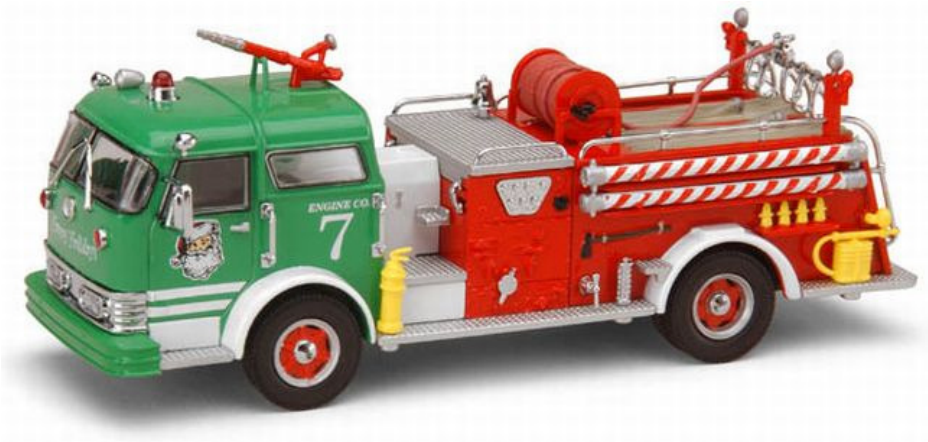
Above: Code 3 Christmas Appliance 2004

ANNUAL GENERAL MEETING 21 – 23 January 2005 Caversham School Hall DUNEDIN GET YOUR REGISTRATION IN NOW!!!