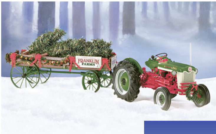
Above: Franklin Mint 1:12 scale Ford tractor with trailer and Christmas load

12520 '70 Mercury Cougar Eliminator 12521 '70 Mercury Cougar XR7 12523 '03 Ford StreetKa 12531 '62 VW Microbus 12532 VW Touareg 12533 '01 VW Passat sedan 12536 '03 Range Rover 12540 '04 Alfa GT 12542 VW New Beetle Convertible 12543 '70 Chevrolet El Camino 12544 '03 Citroen C2 12545 '61 Lincoln Continental 12546 '82 Corvette 12528 '02 Dodge Ram 1500Quad Short Box