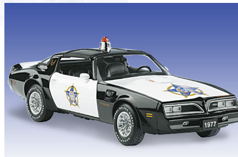
Right: Franklin Mint 1:24 1977 Pontiac Firebird Police Car in Fraternal Order of Police colours