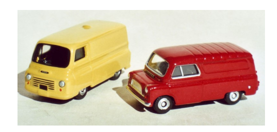
LD, Bedford CA, Ford Transit and Morris J2.

One of the ranges Corgi inherited from their Lledo purchase was the Trackside 1/76 (model railways 00 scale). Up until recently, the offerings were of medium and heavy commercials. Now they have some light vans of the 50s and 60s available. Morris