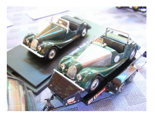
37th AGM competition entries