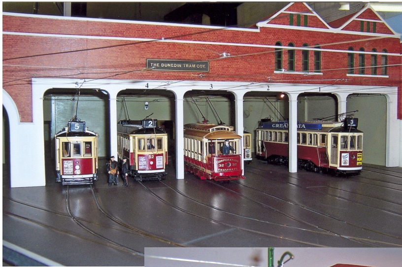
Lester Hopkin's Tram Layout