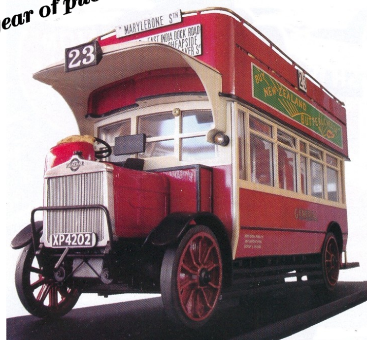
Scratch built 1:24 London NS Type Bus Graham White.