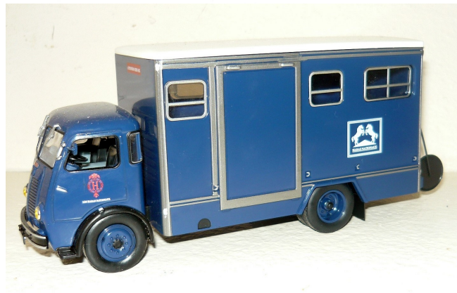
Saviem horse float