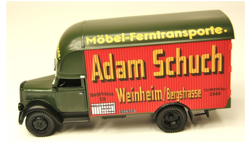
Opel Blitz van