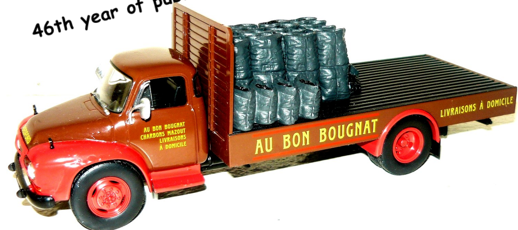
IXO/part-work 1:43 Bedford TJ (see page 7)