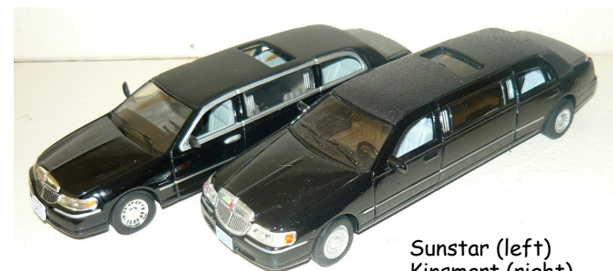
Sunstar (left) Kinsmart (right).

When I received it, it looked familiar. So I checked my shelves and found a Kinsmart version of the same car, although the base claims it is a 1999 model. It also claims that the scale is 1:38 but it is only a little bigger than the Sun Star one. Back in the day, it was quite common for the Hong Kong toy makers to copy other company's products, so I assume that the Kinsmart one is the copy. It is definitely down the toy end of the market however. It has opening doors, sliding roof section and a pull-back wound motor that intrudes into the back seat. The Sun Star one on the other hand does not have any opening parts and the roof opening isn't glazed at all. Paintwork is rougher on the Kinsmart version especially the simulation of the vinyl roof. Both are painted black.