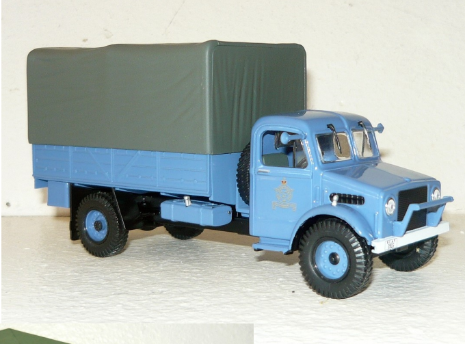
The IXO Bedford OYD in R.C.A.F colours.