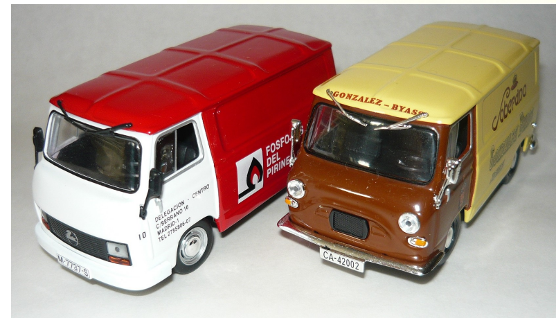
Two versions of the Austin J4 (a.k.a Sa- va)