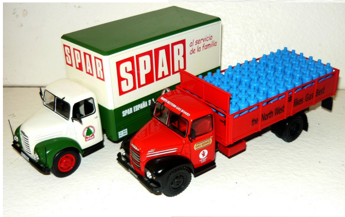
EBBRO C-45 van (far left.) Fordson Thames Trade ET7 (left)