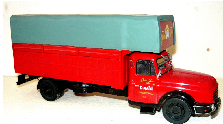
Willeme cov- ered lorry (same type as French Dinky)