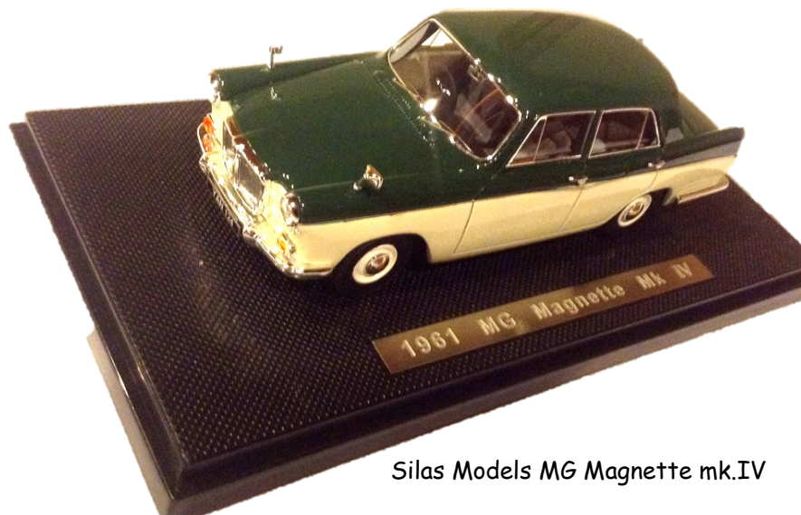
Silas Models MG Magnette mk.IV

models produced by Silas Models of France. Vauxhall Viva HA and FB Victors have recently been produced, and Riley. MG (Mk IV Magnette) and Wolseley versions of the Farina Family are appearing now. A 1952 Jensen Interceptor has also just been released. What wonderful examples of the British motor industry.