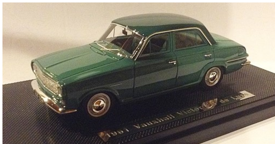
Silas Models Vauxhall Victor 1961