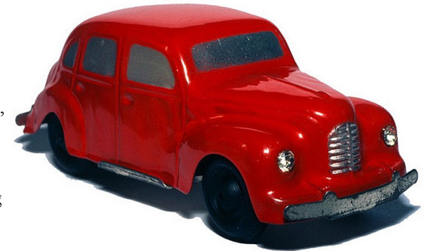
Dibro Austin A40