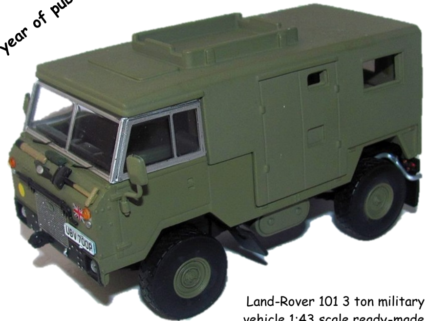
Land-Rover 101 3 ton military vehicle 1:43 scale ready-made.